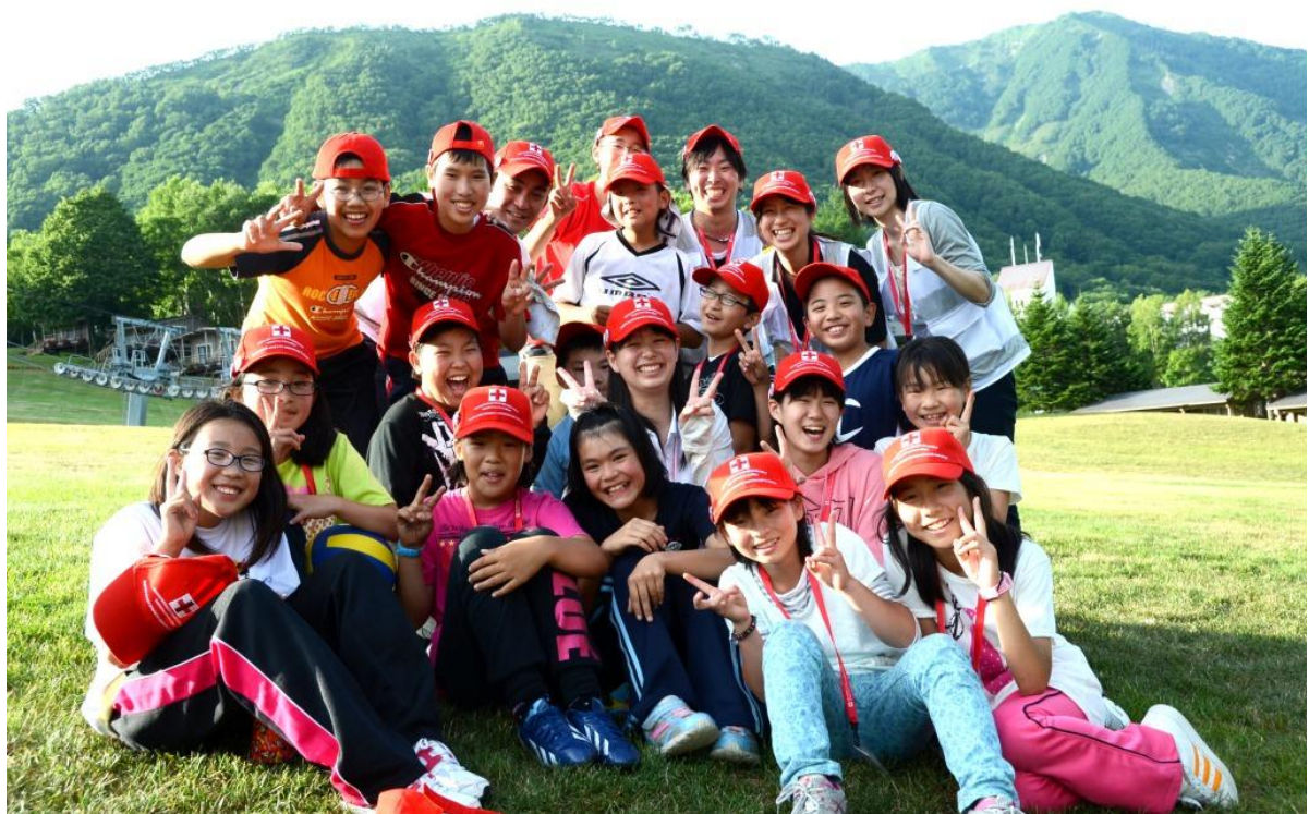
Joyful memories of a summer camp with group mates and volunteers in Hokkaido

Period covered by this report: 1 July 2013 – 30 September 2013