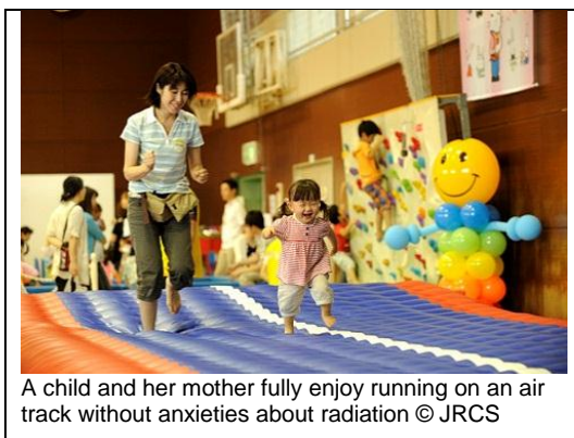
A child and her mother fully enjoy running on an air track without anxieties about radiation

The indoor playground project, Smile Parks, started in February 2012. Smile Parks are one of the largest mobile indoor playgrounds provided in Fukushima prefecture. The project was highly appreciated by parents and therefore the JRCS chapter of Fukushima decided to continue this project. "Smile Parks", indoor playground sessions, continue to help children in Fukushima to let off steam safely, while their parents need not worry about exposure to radiation. The locations are selected to maximise participation by children and their parents, including evacuees from other areas. Smile Parks in 2013 have been operating since July with new features, such as an educational programme and weekend shows by famous cartoon characters. The park provides an air-running track, a ball-pool, a ring toss game, climbing sessions, drawing and cultural classes, and sports trials. There will be a further four events until the end of December.