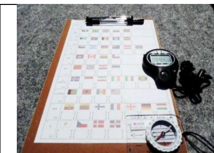
One hundred national/territories' flags identify donors of GEJET relief and recovery programme