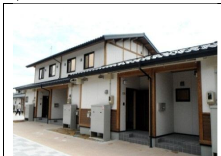
The first public housing in Otsuchi town enables evacuees to resume their lives.

In the town of Otsuchi, almost 60 per cent of the houses were destroyed by the tsunami. The project aims to provide inexpensive rental houses for those who cannot afford to rebuild their own houses. Housing and community centres, which will accommodate 730 households, are planned and JRCS will finance one eighth of the total costs for the construction. This project is proceeding in collaboration with the municipality and the Urban Renaissance Agency 7 . In August, construction of homes for 104 households was completed and an opening ceremony was held. These are the first public housing projects in this municipality. The occupancy rates of the completed housing have reached more than 95 per cent. A further public housing project is scheduled to be built by December, with further developments in the process of planning and design.