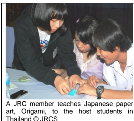
A JRC member teaches Japanese paper art, Origami, to the host students in Thailand

Various activities led by local chapters and JRCS volunteers have been carried out in the three most afflicted prefectures. Also, JRCS volunteers organised three meetings and trainings to share information, concerns, and tips to improve the activities in affected areas. In Miyagi and Fukushima, musical theatres and a short-term summer school were held for children, who are still under stress as a result of a prolonged period spent in temporary housing and schools. JRCS chapters also organised international study tours in Thailand and the Philippines in collaboration with the Movement. These two countries have also experienced devastating floods, typhoons and earthquakes, so the 27 Japanese children and young people selected to visit them were able to share experiences of the current situation in the affected areas at grass-roots level and to deepen cultural understanding of each other.