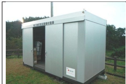
DP material and storage unit with a solar LED light distributed to municipalities. The solar light can help the unit to be found in the dark in case of emergency

JRCS is supporting municipalities in the affected areas in strengthening their preparedness for future disasters. JRCS provides storage facilities and equipment for disaster preparedness, such as generators, cord reels, floodlights, lanterns, portable toilets and partitions. The procurement and distribution started in April and 109 storage units were set up in 10 municipalities so far. More than half of the storage facilities have been distributed. Following requests from municipalities, solar power systems with LED lights are also being provided. All distribution will be completed by December 2013.