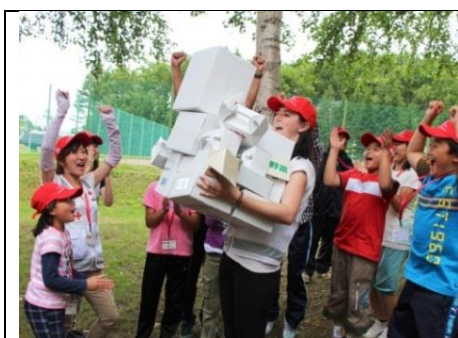
The workshop on dietary education taught an importance of well-balanced meals using the visual aids.