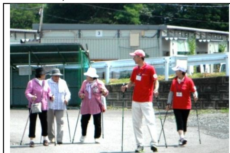
JRCS volunteers adjust the pace to women who have recently joined in the walk

The purpose of this activity is to ease the stress of the elderly who tend to lack physical exercise in the unsettling life style forced on them by the living conditions in the prefabricated houses. This project promotes health through exercise and builds a stronger sense of community. Initially, JRCS Iwate chapter in collaboration with the Hokkaido chapter provided this activity and later it was taken up by other chapters. As noted previously under psychosocial support, JRCS Iwate Chapter has been organising Nordic style walking with tea parties and increasing regular activities to let people join in sessions more casually and frequently. From July to September, 29 events were held with 195 participants in Iwate and seven events were organised, with 141 participants in Fukushima. The number of participants newly joining has gradually increased. JRCS Fukushima chapter is expanding its target beneficiaries not only to evacuees in prefabricated housing clusters but also to evacuees separated from their community in temporary housing settlements. The project continues and is much appreciated by the participants.