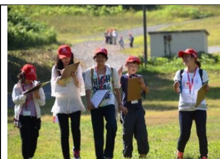
Orienteering aimed to provide a time for physical exercise and to promote children's understanding on the donors of JRCS recovery programme for GEJET