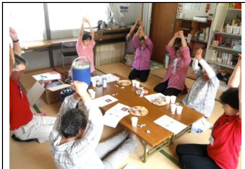
JRCS volunteers teach indoor exercises to evacuees in a common room of a prefabricated housing cluster

The three prefectures have been implementing various events for psycho-social support which are led by the JRCS chapters. The project includes Nordic style walking (see sections 6-9) in Iwate and Health and Social Classes (see sections 6-10) in Miyagi, soup kitchens, blood-pressure checks, health consultations, tea parties, relaxation and entertainment for children. JRCS staff have been continuously visiting the prefabricated housing, allowing them to build a good relationship with the beneficiaries and help establish a sense of community in the prefabricated clusters.